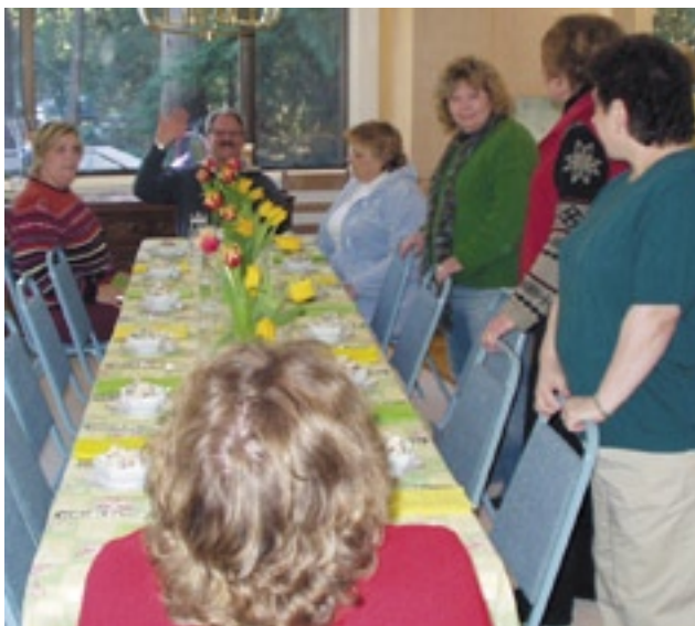
Left: Lunch time!